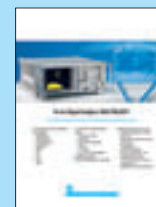
Data sheet R&S FSQ-K70