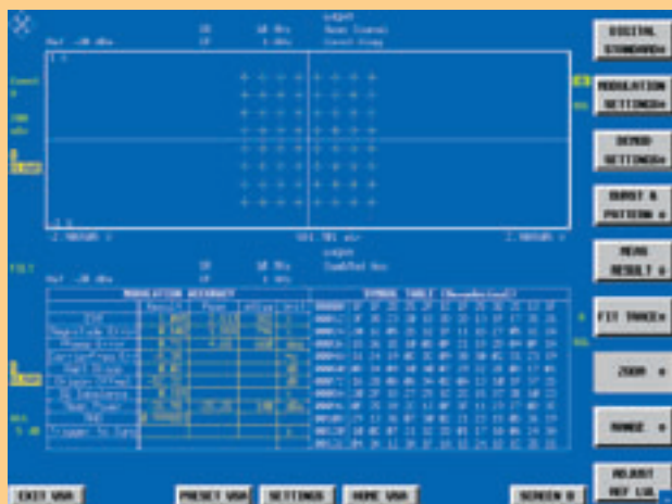
FIG 2 Constellation diagram, numeric result display and decoded symbols of a 64 QAM measurement signal.

R&S FSQ-K70 allows triggering to external trigger events, bursts and synchronization patterns contained in the data stream. Triggering can be either to one synchronization pattern at a time or even to several patterns simultaneously. For GSM, this means that the analyzer searches for all training sequences (TSC0 to TSC7) and, without knowing the pattern actually transmitted, reliably demodulates the signal. Triggering to burst signals can be very finely parameterized. The analyzer normally determines the level threshold values automatically; as an alternative, they can also be specified manually.