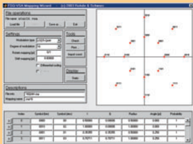
FIG 4 Creating a user-defined constellation.