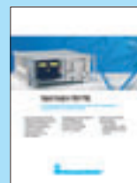
Data sheet R&S FSQ

More information and data sheets at www.rohde-schwarz.com (search term: FSQ-K70)