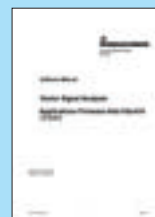
R&S FSQ-K70 manual